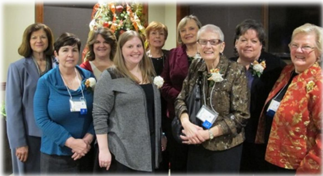
Some of our newest members at the holiday dinner

We feel so fortunate to have closed out 2014 with a lovely holiday dinner that included a celebration of 23 new members. Many new members have become actively involved in our Branch and we want to thank them for the skills and enthusiasm they bring to our circle!