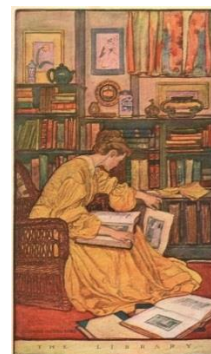
The Library Elizabeth Shippen Green