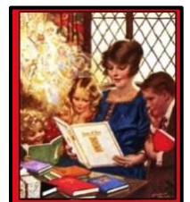
Vintage Illustration from The Publishers Weekly , 1922

Whatever holiday you celebrate this season, may it be filled with love, laughter and lots of books.