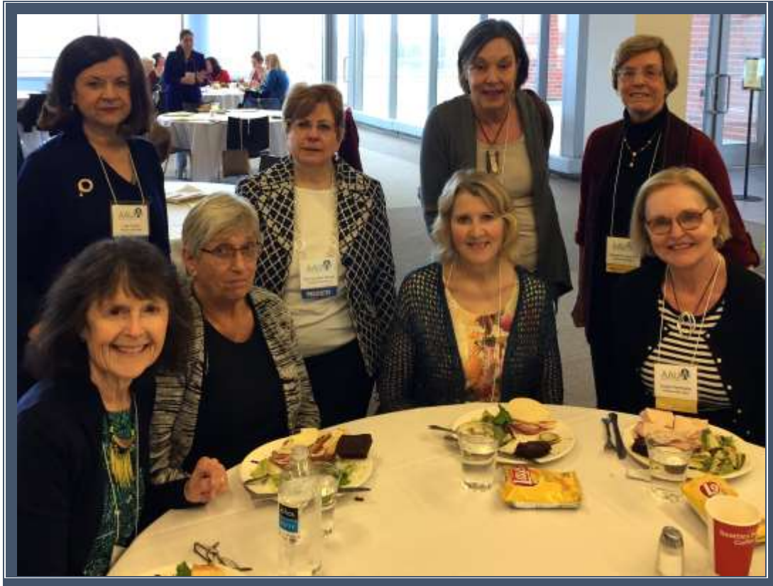
AAUW-Illinois State Convention, April 2018

The following members represented our Branch at the convention: