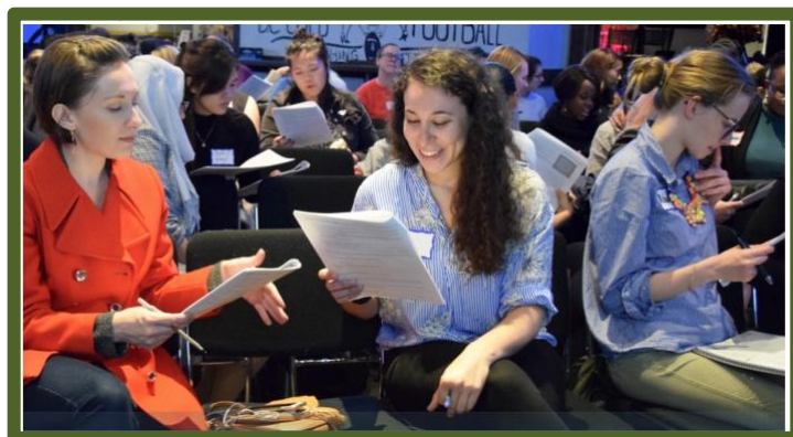
Participants role-play to learn how to negotiate salary at the Work Smart workshop in Washington, D.C.