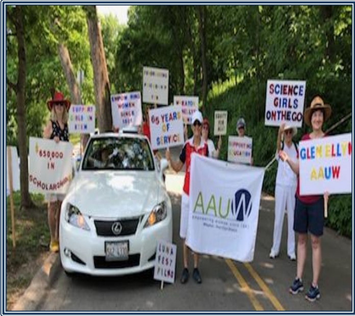
Glen Ellyn Fourth of July Parade, 2021

Volunteers are seldom paid; not because they are worthless, but because they are PRICELESS!