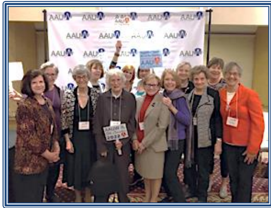
AAUW-IL State Convention, May 6, 2022