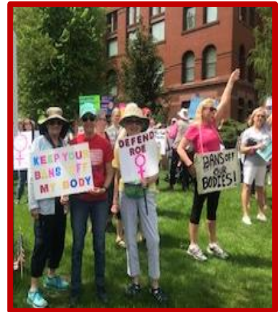
Women's March, Bans Off Our Bodies Geneva, Illinois May 14, 2022